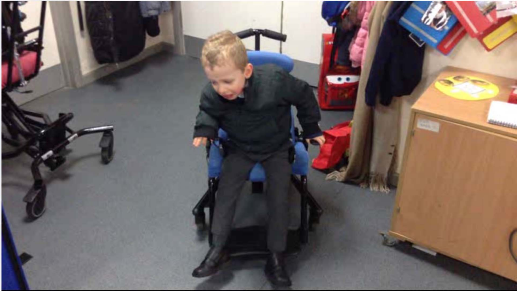
Child B Independently moving from chair.