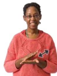
Sing and sign