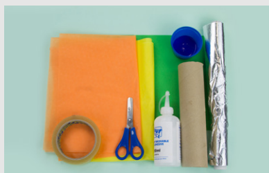
– Sticky tape